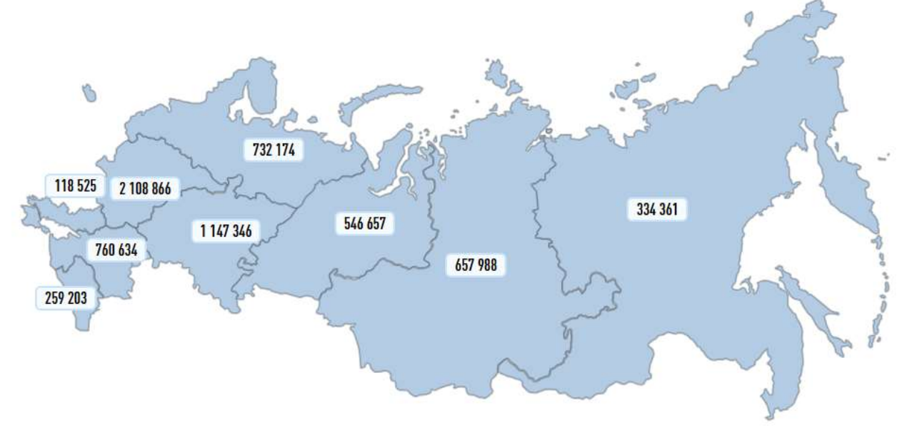
Figure 1 – Small and medium-sized enterprises in Russia [1]

According to the unified register of small business entities posted on the official website of the Federal Tax Service, as of March 2025, there are over 6 665 754 small and medium-sized enterprises in Russia [1] (Figure 1).